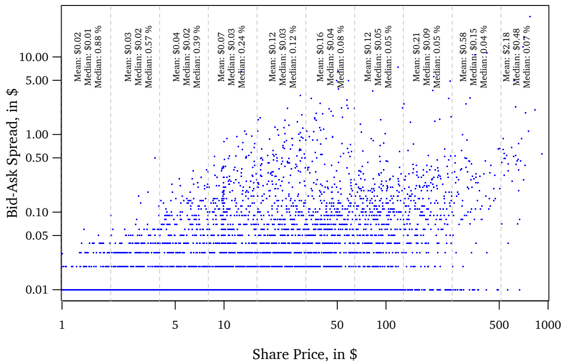
Figure 11.2: Bid-Ask Spreads on Dec 31, 2021. Each dot is one stock. Many are so dense that they look like a continuous line. Most stocks have a bid-ask spread of only $0.01 per share, though spreads of between $0.02 and $0.05 per share also not uncommon.

For example, on Dec 31, 2021, the mid-price for Intel ( INTC ) shares was $51.51. But you could neither buy nor sell at $51.51. Instead, the $51.51 was really just the average of two prices: the bid price of $51.50, at which the market maker was willing to buy shares and the ask price of $51.52, at which the market maker was willing to sell shares. (These prices are themselves determined both by other investors and the inventory of the market maker.) For a small transaction, up to 100 shares, the bid and ask prices are even guaranteed (until the next update). For larger lots, the prices may also move a little. However, for a company as liquidly traded company as Intel, even $50,000 would be unlikely to move prices. Therefore, you could (probably) purchase shares at $51.50 and sell them at $51.52, still a loss of “only” 2 cents. This amounts to round-trip transaction costs of (\$0.02)/\$51.52 \approx 0.04\% .